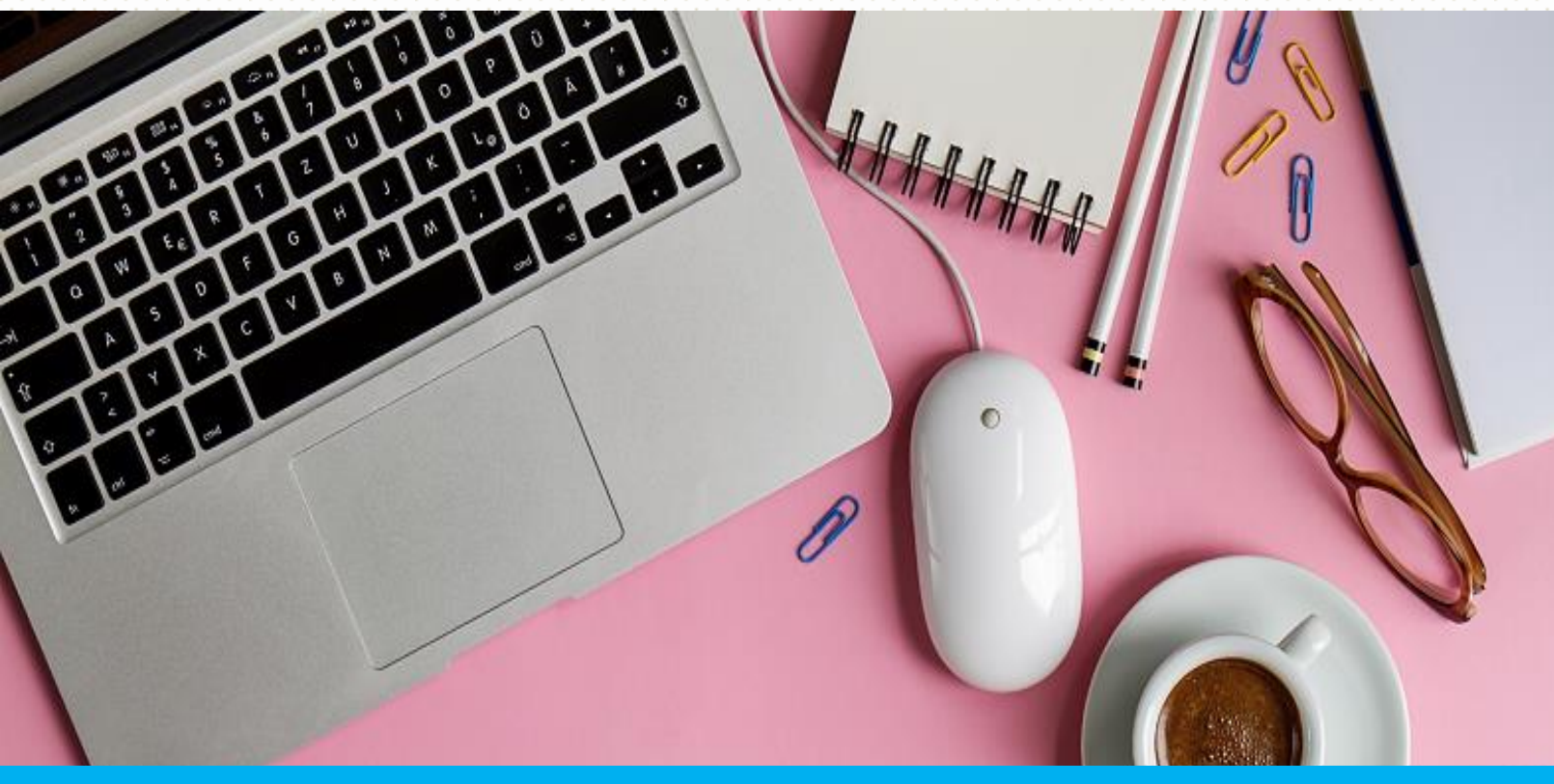
"Conventional means of material procurement are inconvenient & time consuming"